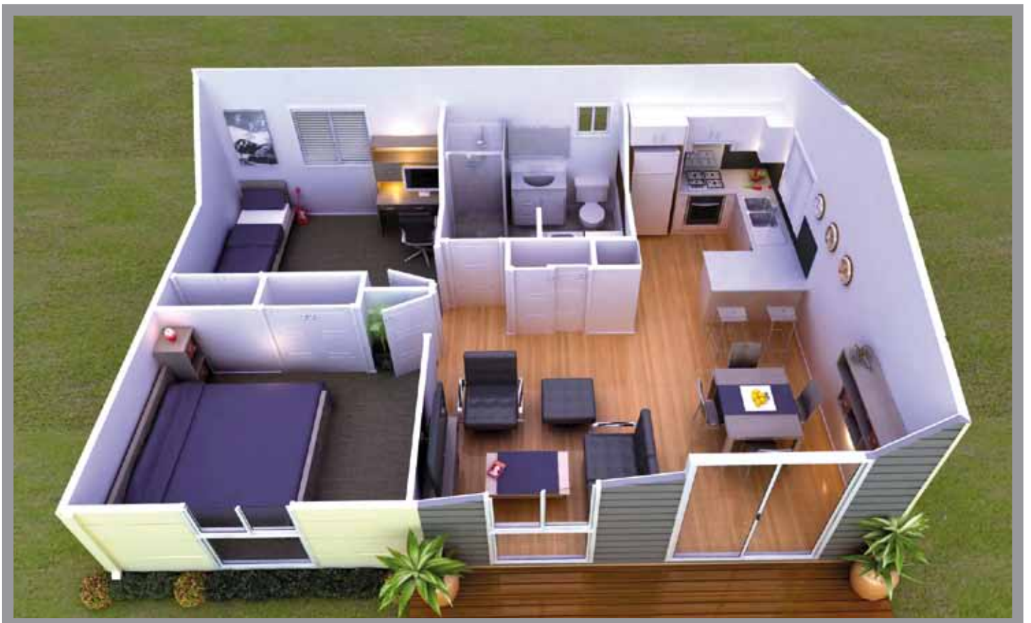
Granny Flat two bedrooms also available in three bedrooms 10m x 7m