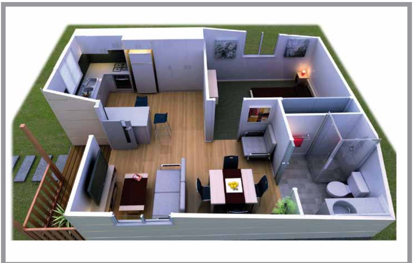
Granny Flat one bedroom 8m x 6m