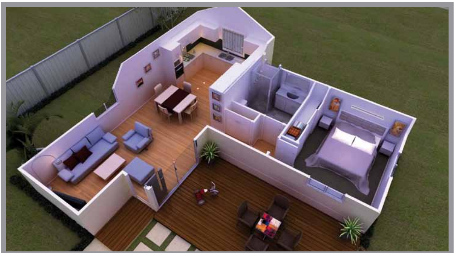
Granny Flat two bedrooms 'L' shaped also available in three bedrooms 9m x 6.5m