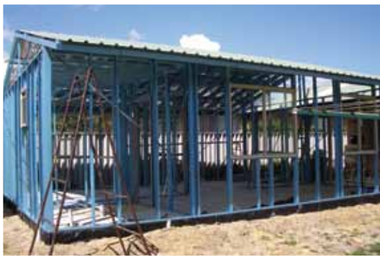
Bluescope Australian Made Steel Frames