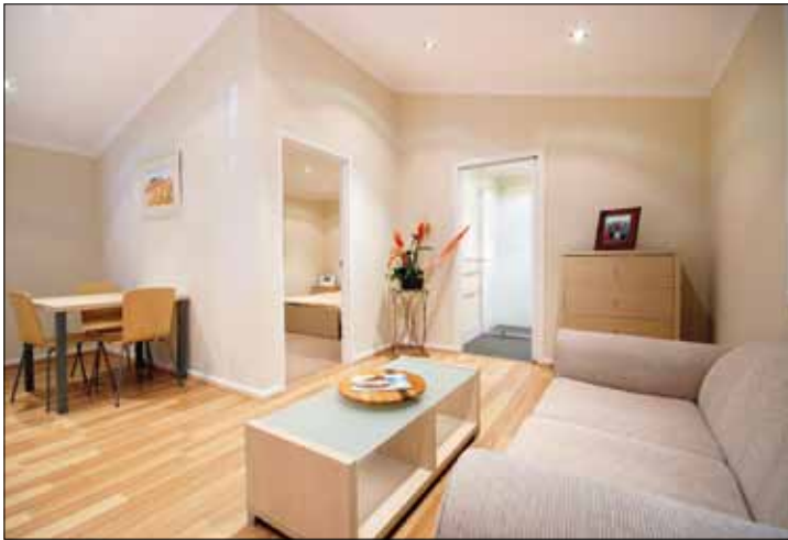
High Raked Ceilings in Living Meals and Kitchen