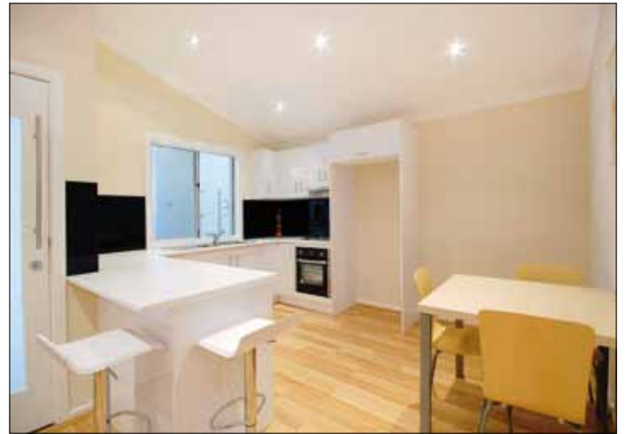
Large Kitchen with Breakfast Bar