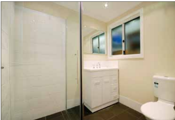
Full Tiled Bathroom fit out