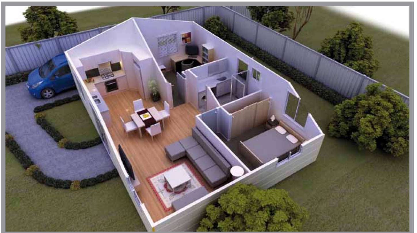
Granny Flat two bedrooms also available in three bedrooms 10m x 7m