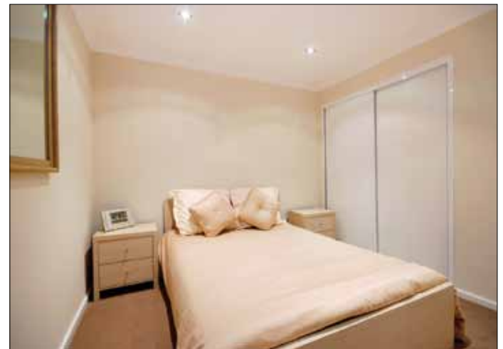
Generous sized Bedroom with Robe