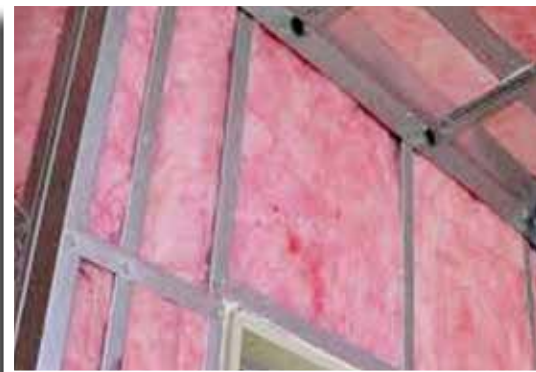
Batts Insulation to Steel Frames