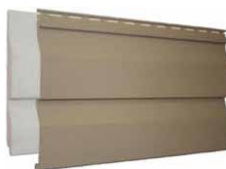
Exterior Cladding with Built in Insulation