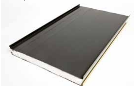
Insulated Panel Roof for Rain noise reduction